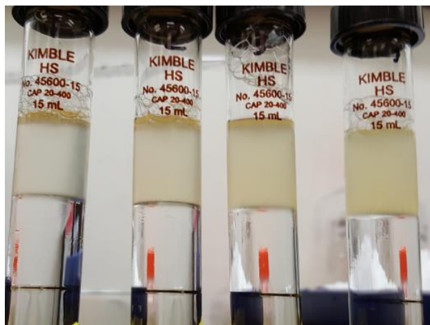
Fig. 5 Density gradient assembly for nuclei purification (Day 1, step 28)

Nuclei suspensions are from four fresh young cotton leaf samples.