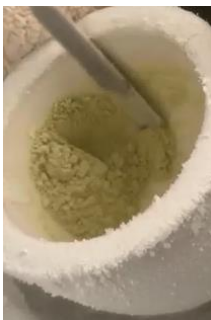
Fig. 1 Fine powder of 0.5 grams of fresh young cotton leaves by liquid nitrogen grinding (Day 1, step 14).