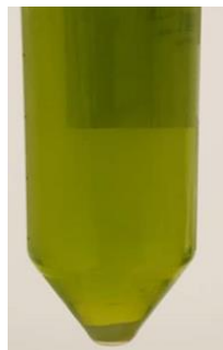
Fig. 2 Pellet nuclei using a swing bucket rotor on grapevine fresh young leaves (0.2 g, Day 1, step 21).