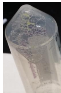
Fig. 3 Residuals left after the low speed spin (Day 1, step 24).