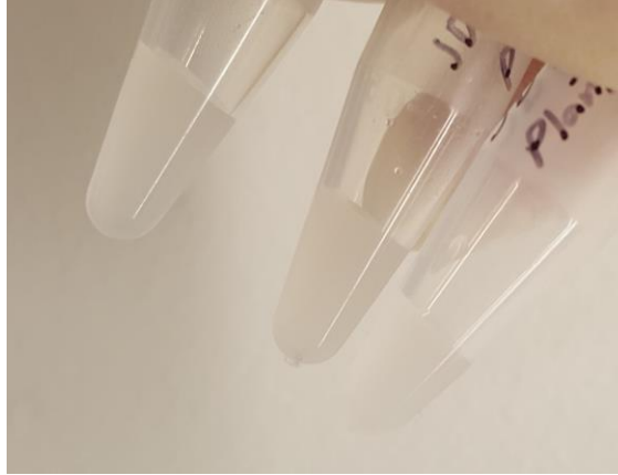
Fig. 7 Purified DNA should be free of visible debris (Day 2, step 22). If debris is observed, consult customer support