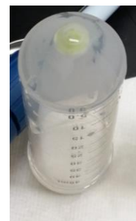
Fig. 4 Ideal pellet should have yellow/light green or white look before starting density gradient purification (Day 1, step 25)