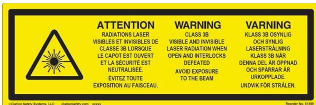
Figure 1: Class 3B Laser Warning