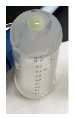
Fig. 3 Ideal pellet should be yellow/light green or white before starting density gradient purification (step 29).

Fig. 2 Residuals left after the low speed spin (step 28).