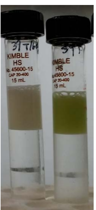
Fig. 4. Density gradient assembly for nuclei purification (step 32; left: tomato; right: maize)

Fig. 3 Ideal pellet should be yellow/light green or white before starting density gradient purification (step 29).